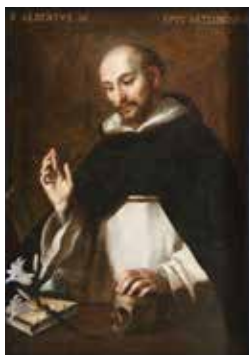
St. Albert the Great