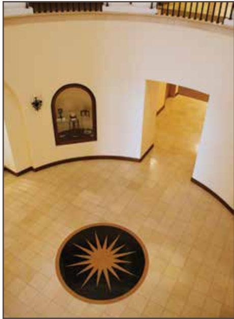
The sunburst, symbol of St. Thomas Aquinas

when and if he comes to know (which is the purpose of his investigation) the matter ceases to be doubtful to him, and his mind closes to the possibility that the opposite might be true. He is no longer free to doubt, except willfully. Thus by the assumed definition ignorance makes free, while knowledge enslaves. A reply to this objection might assume that knowledge is simply unattainable, inasmuch as all things