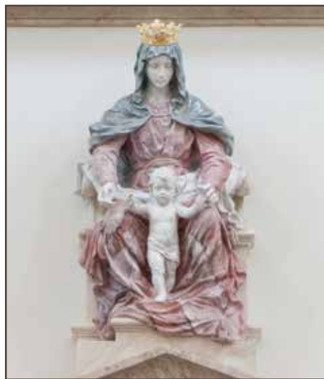
Our Lady, Seat of Wisdom

Accordingly, to speak in summary, the Christian intelligence is formed by an acceptance of certain fundamental distinctions and a recognition of the order among the objects of thought: some are of faith, others of reason; some certain, others doubtful; some self-evident, others not; some demonstrable, others not; some subject to criticism, others not. This awareness of the distinction between the primary and the secondary in human knowledge makes true freedom of inquiry possible, for only the recognition of the difference between the unquestionable foundations of criticism and doubtful matters subject to criticism can give reasonable direction to inquiry. Or to speak generally, to live in freedom is to live by the truth.