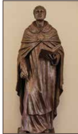
St. Thomas Aquinas

Similarly, its courses in physics and chemistry presupposed, without question, a philosophical view about the nature of matter and motion which contradicted what was taught in the philosophy courses. b) But even within the philosophy curriculum itself anomalies existed. The philosophical formation of the students was essentially faulty in that faculties themselves were fundamentally divided on the question of whether there is philosophy or merely philosophies. The effect of this division was to propose to the students that philosophical education would at once lead to a certain understanding of reality, which understanding was at the same time relative basically to the changes of time and place. This opposition was in effect between those who claim something can be known and those who are skeptics — and the resultant effect on the students, who quite naturally attempted to integrate both positions, was skepticism. Skepticism, of course, defeats the purpose of the intellectual life by denying the possibility of knowing anything. c) The proponents of perennial philosophy sought to be true to the nature of Catholic education as traditionally understood by the Church and,