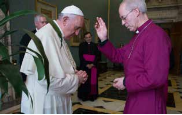
With Justin Welby, Primate of the Anglican Church. 2014