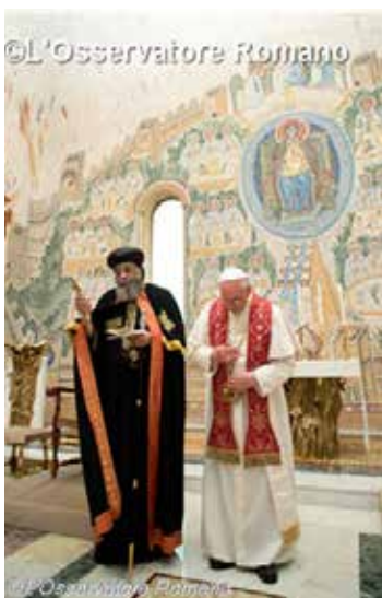
With Tawadros II, head of the Coptic Orthodox Church of Egypt. 2013