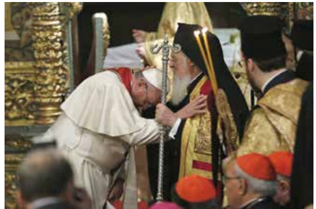
With Patriarch Bartholomew I, of the Orthodox Church of Constantinople, asking for a blessing and for 'the whole Church of Rome', November 29, 2014.