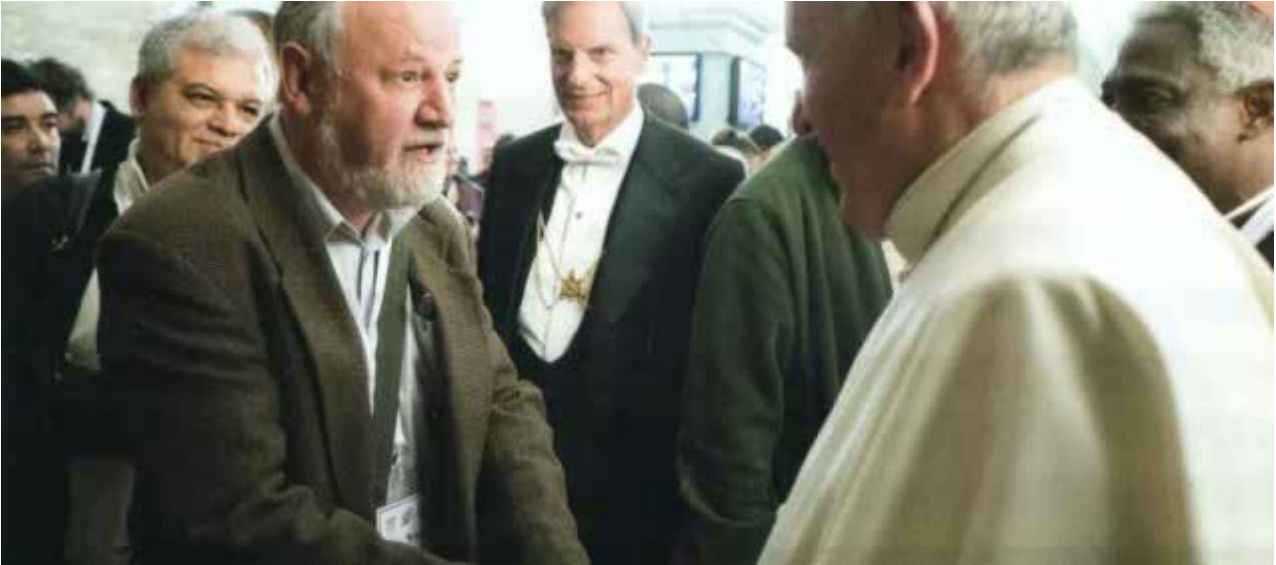
Francis greets Stedile during the I World Meeting of Popular Movements, Rome, October, 2014

UPDATE – A Venezuelan priest sends us this interesting document on the work carried out by Stedile on March 5, 2015, for the Bolivarian commemoration of the second year of the death of Hugo Chavez: