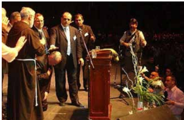
As cardinal, being blessed by Evangelicals at Luna Park, Buenos Aires, Argentina, June 19, 2006.