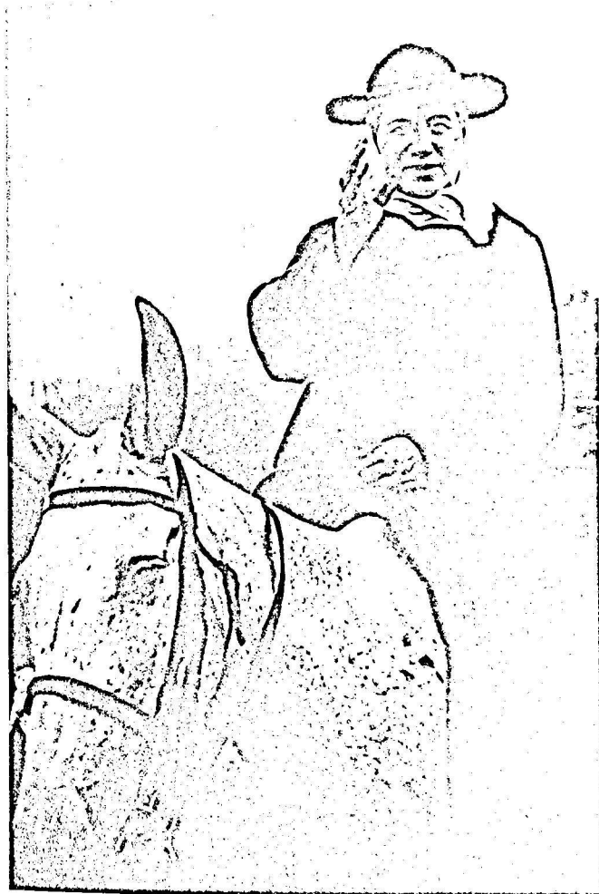
Giuseppe Sarto as Cardinal Patriarch of Venice.