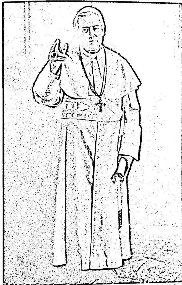
A photograph of Pope Pius X from the earliest days of his reign, showing the sadness so often evident on his face after his election to the pontificate.