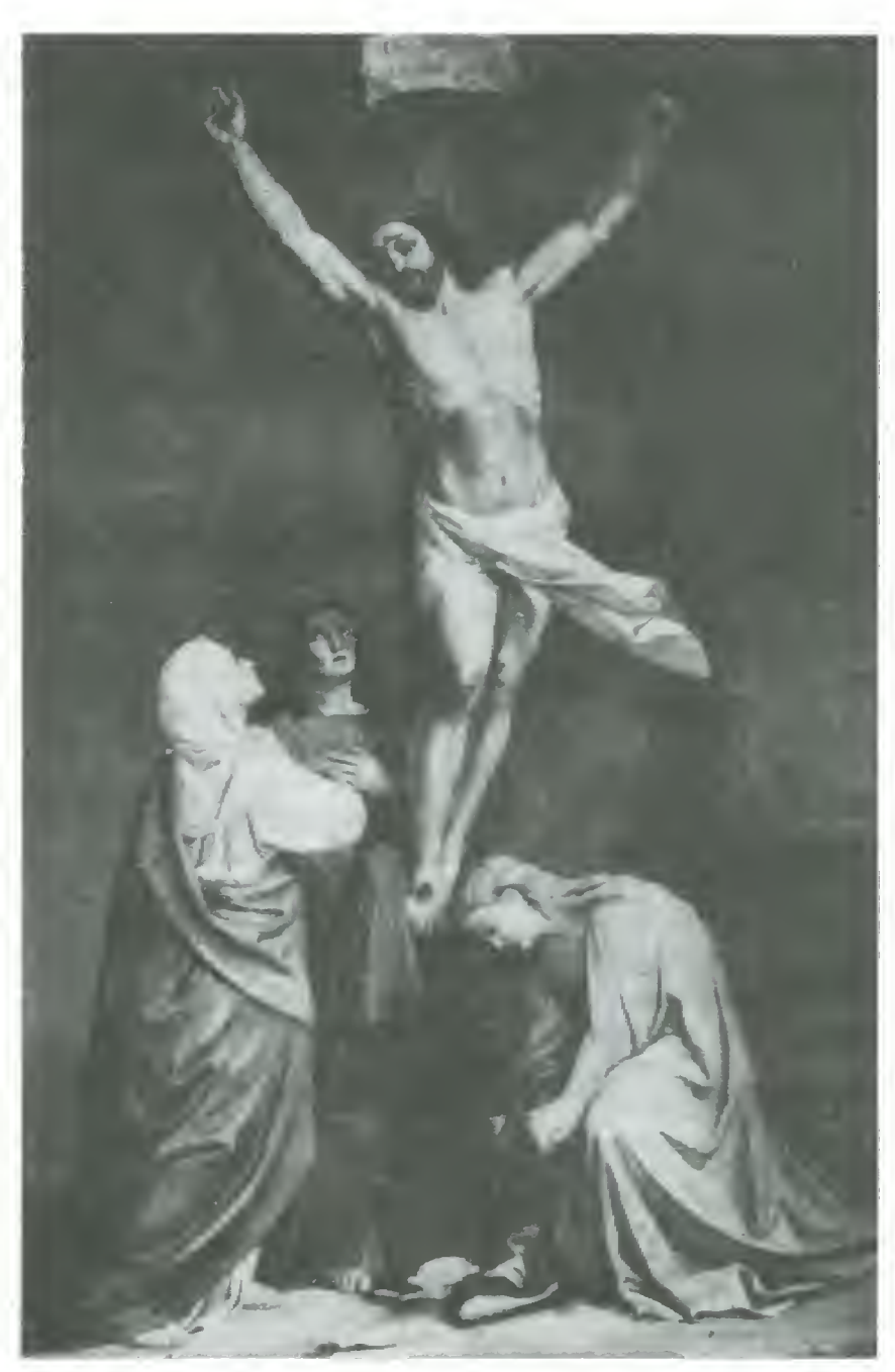
The picture of Calvary which bled