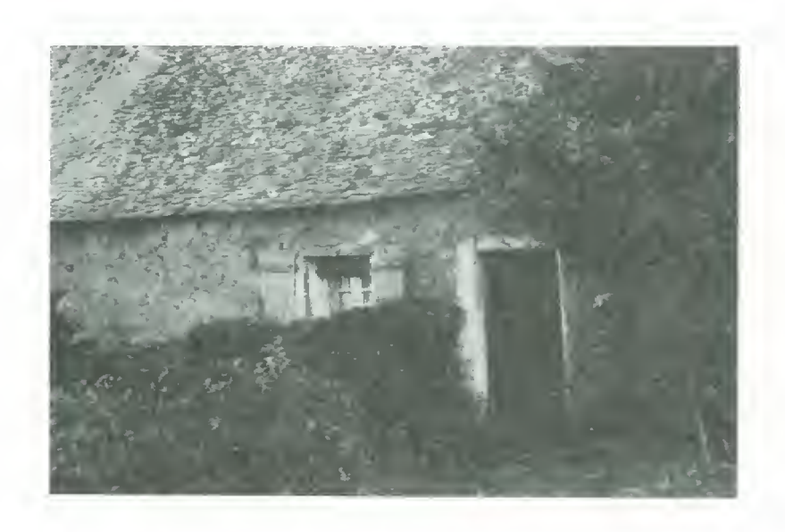
The back of the cottage

• THE TIME OF CRIMES HAS BEGUN... THE DEVIL WILL APPEAR IN THE FORM OF LIVING APPARITIONS... WOE TO THOSE WHO DARE TO MAKE PACTS WITH THESE PERSONAGES WHO APPEAR IN