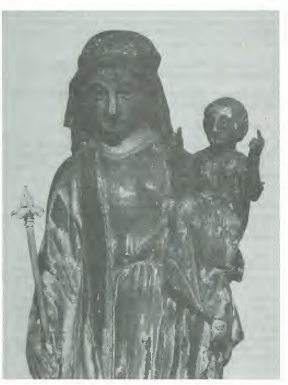
The miraculous statue of Our Lady of Bonne Garde