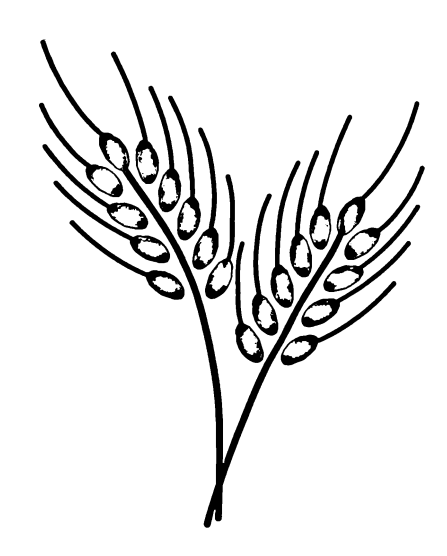
Treatise 5. On the Angels