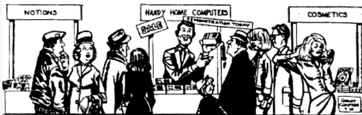
Figure 3 (label added for this reprint)

sands of components in a single silicon chip?