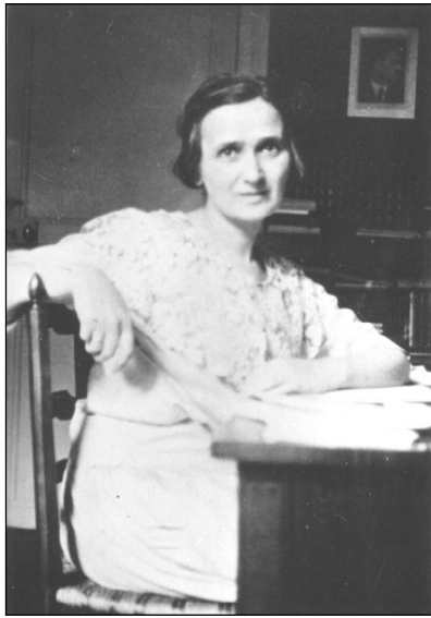
FIGURE 1. Raïssa Maritain, c. 1934.

issue. 6 Individuals such as Bloy, Péguy, and Maritain resist simple appraisal; they fit uneasily into contemporary notions of religious tolerance. Bloy scorned politics as a means to reduce the suffering of Jews, and his theology is deeply entangled with essentialized images of Jews of the worst sort. In addition to Bloy, Péguy's courageous philosemitism also harbors troubling essentialist notions of Judaism; and Maritain, a Jewish convert to Catholicism, forthrightly advocated Jewish conversion to Christianity like her godfather Bloy. Certainly, to reawaken these revivalists is not to discover finally a uniformly safe or liberative Catholic position on Judaism. The analysis that follows aims to untangle the ambivalence of these philosemitic endeavors and track how these revivalists' thinking underwent significant revisions in the years before the Shoah.