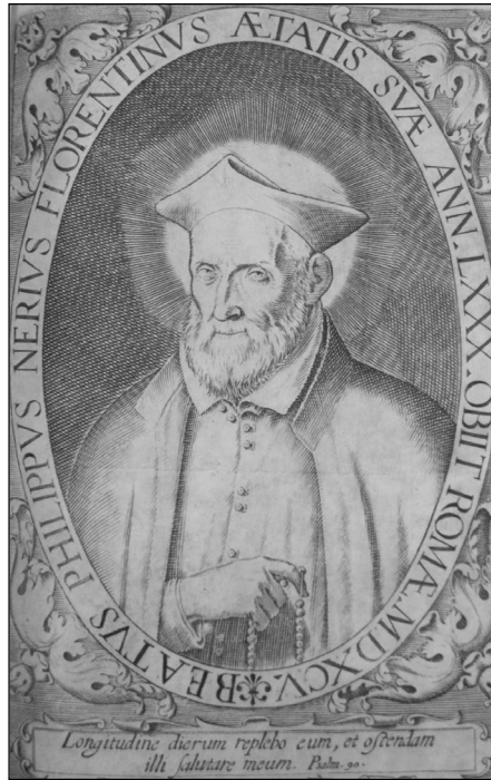
FIGURE 3. Oratorian founder Filippo Neri.

likeness as similar to a saint's portrait and intended it to promulgate the Oratorian's fama di santità . 66 The sanctifying and propagandizing functions of the De bono Philippine portrait were ostensibly confirmed by its concurrent circulation in certain copies of De bono with the epithet "R. PATER" substituted by "BEATUS," although Pope Paul V did not beatify Neri until May 25, 1615 (see figure 3). Regarding saints' portraits, Paleotti had resorted to prevarication in the Discorso , contrary to his theorizing contemporaries Molanus, 67 Domenico Anfossi, 68 and Borromeo 69 :