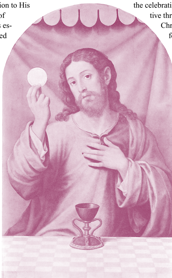
Christ and the Chalice by Juan de Juanes

With Christ and His Church is associated in third place