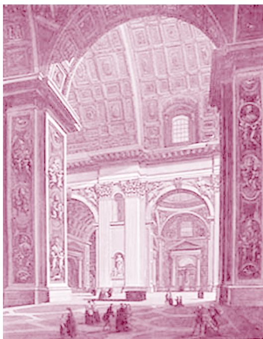
The Nave of St. Peter's Basilica, Rome

Yet since a ritual is a combination of the prayers and gestures, then the more the gestures suit the one who