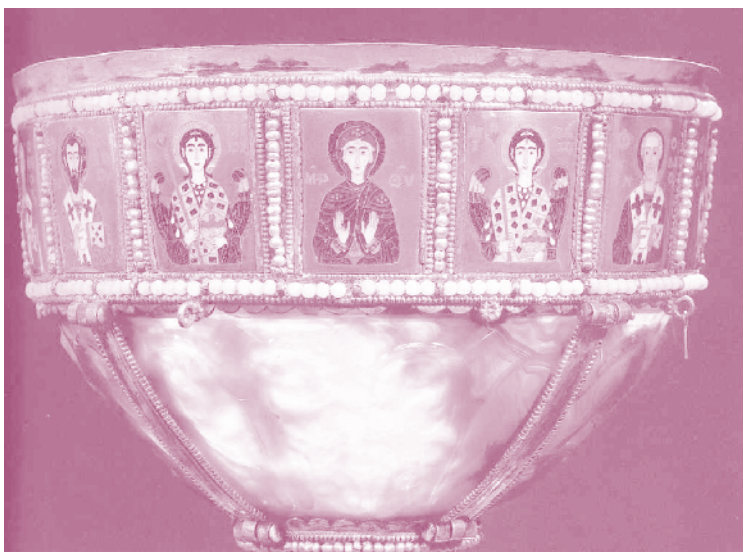
Romanos Chalice of St. Mark, detail

One of the primary difficulties of the new rite is the disappearance of this differentiation, with the ritual reduced to one form of the Mass with only very minor variations, usually in music and things of that sort. In the past it was understood that there were different feasts and occasions as well as priests who offered the Mass, and so one should offer different Masses as well as use different items suited to the Mass and the state of the priest who offers the Mass. While it is true that we can use different