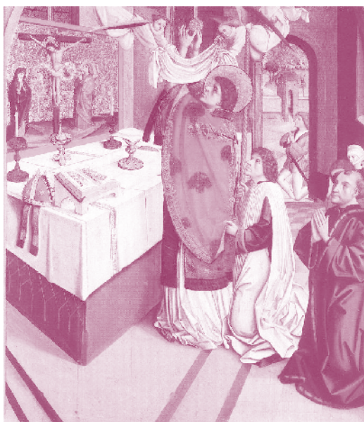
The Mass of St. Martin by an unknown Hungarian master

The ritual of the Mass ought to be ordered to God and not to man, except insofar as man is served in order to serve God. In other words, God is the end of the ritual, not man.